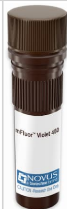
mFluor™ Violet 450

CD79A Antibody (HM57) [mFluor Violet 450 SE] [NB100-64347MFV450] - Vial of mFluor Violet 450 conjugated antibody. mFluor Violet 450 is optimally excited at 406 nm by the Violet laser (405 nm) and has an emission maximum of 445 nm.