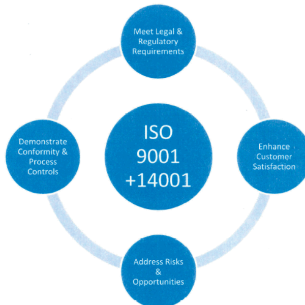
Figure 1 – ISO 9001 and ISO 14001 Synergy